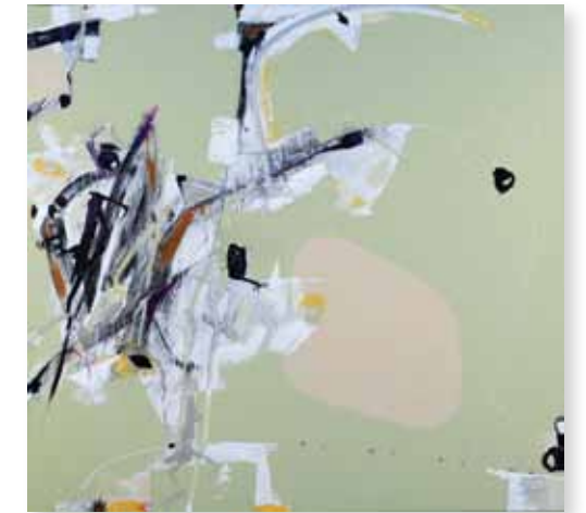
Darryl Erdmann Control Board Acrylic on panel