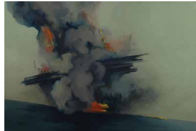
Lenka Konopasek Rig Explosion Oil on canvas