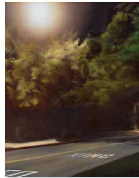
Rebecca Pletsch Street At Night Oil on canvas